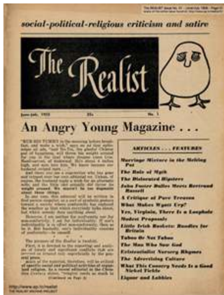
Figure 2: Paul Krassner's humor magazine The Realist