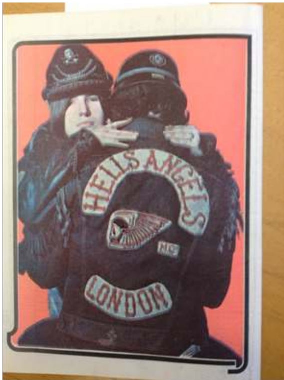
Figure 8: Image of Hells Angel in OZ Magazine