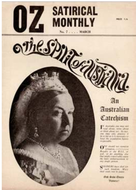
Figure 1: A page from Richard Neville and Martin Sharp's university magazine