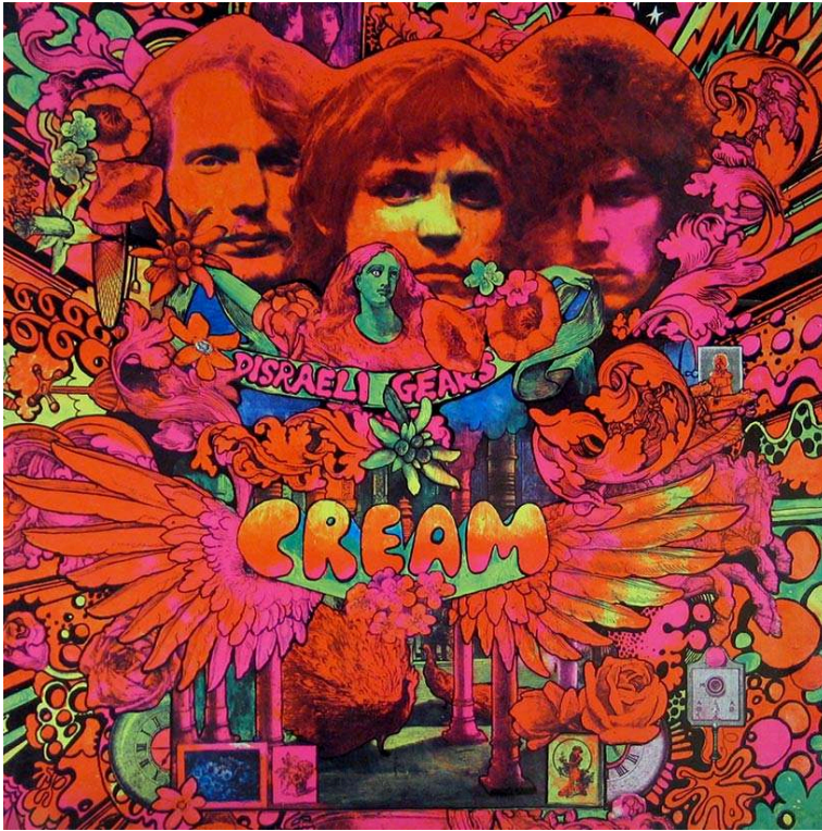
Figure 5: Martin Sharp illustrated album cover for Cream's "Disraeli Gears"