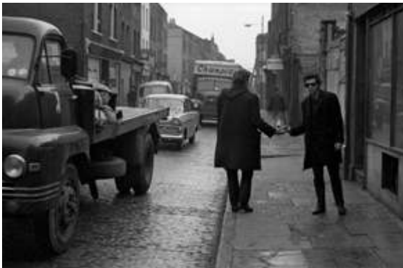
Figure 3: "Marijuana Boys" by John Hopkins