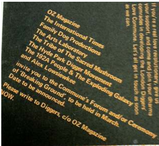
Figure 7: Ad for the Diggers in OZ Magazine