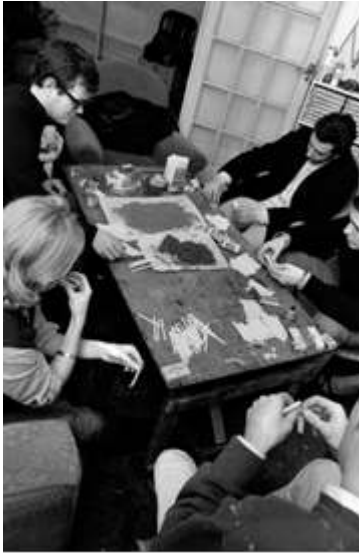
Figure 4: “Joint Factory” by John Hopkins