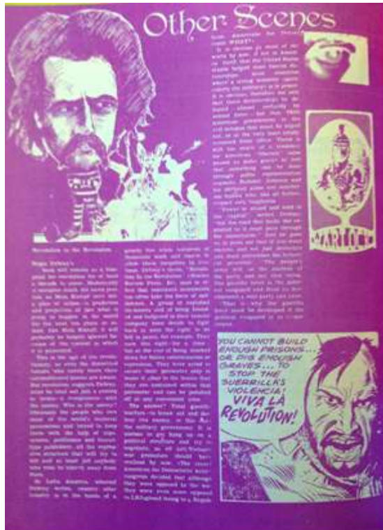
Figure 6: Martin Sharp and Richard Neville's OZ Magazine